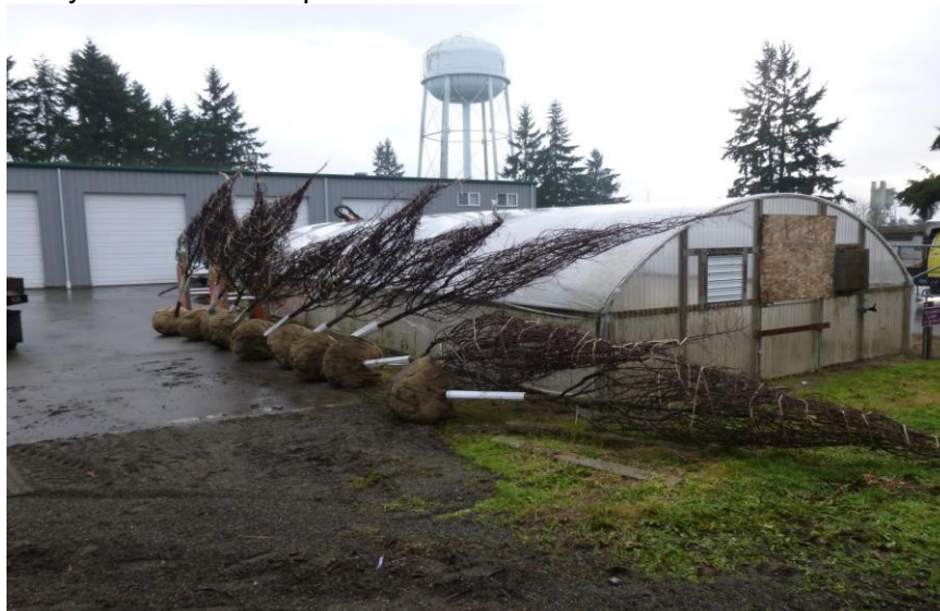
Figure 2. Yelm City Street Tree Replacement Plan

The City shall use a variety of means to enlighten and inform the public and municipal staff about urban forestry and Yelm's program.